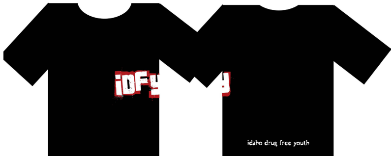
↑ CURRENT T-SHIRT DESIGN

Each submission will be placed on the IDFY Facebook page for voting, beginning October 4th. The design with the most votes will be chosen!